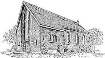
St. Mark, Lions Head Saturday 9:30 am